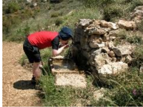
Refreshment at the first spring

Follow the main track until you come to a Nevara (snow well) just below a spring and series of drinking troughs. At the point there are many tracks leading of in all directions. You need to walk up to the top trough and turn left along a feint track that soon improves and once again you will see the yellow and white markers. You are now heading away from the summit mast and towards an obvious rock arch high on the cliffs. The track contours but also climbs gradually until after about 600 metres you reach the base of the cliffs and a rock section up to "Fat mans agony", a narrow section between two sections of rock. You suddenly arrive on the summit "plateau" and get great views of the the huge landslides that took place several centuries ago (possibly the same ones that created the pinnacles at Guadalest). The way on crosses a few of these cracks and then climbs the rounded slopes of Pena Alta. In clear weather you now have great views in all directions including he Penon at Calpe, the Puig campana and the Serella/Aixorta ridges.