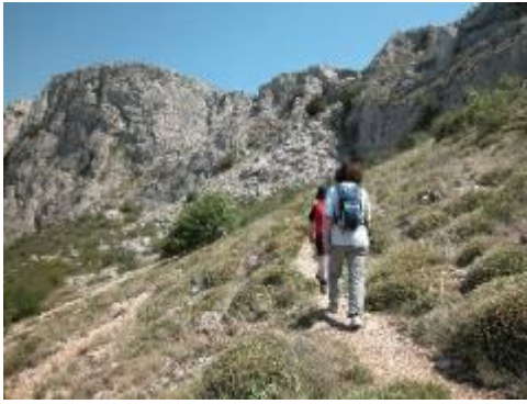
Contouring in towards fat mans agony