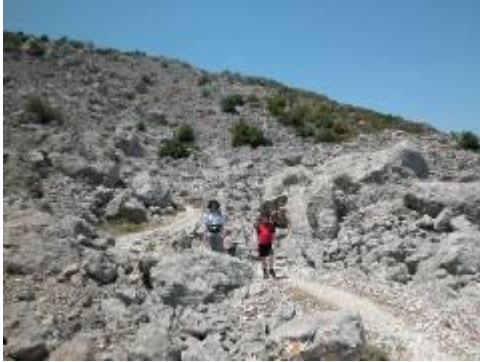
The Partagas boulder field