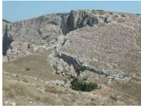
Heading towards Pena Alta